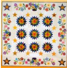
2015 FKOQ Donor Quilt