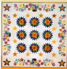
2015 FKOQ Donor Quilt