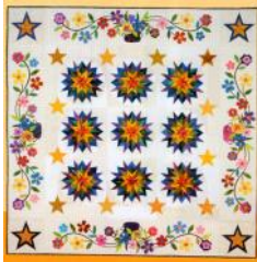
2015 FKOG Donor Quilt